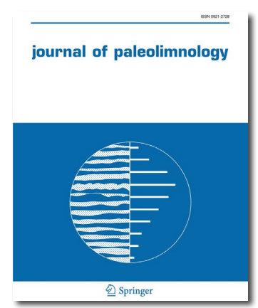
Journal of Paleolimnology